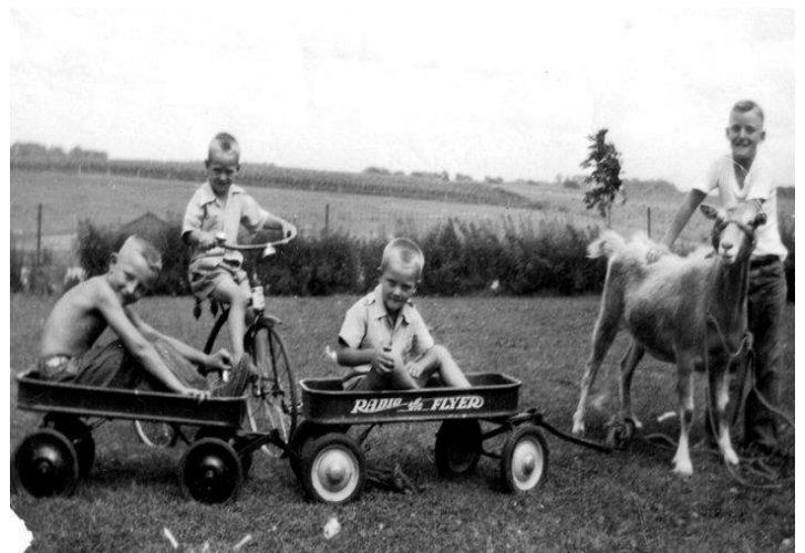
Larry Park & friends 1952

Once you have digital copies of your old photos, you can store them on the cloud such as Google Photos.